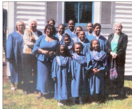
Lambs of God